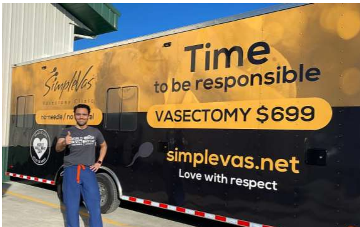
First US based mobile vasectomy clinic. See more photos